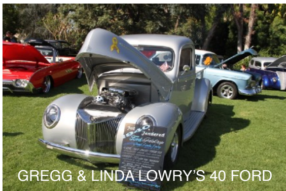
GREGG & LINDA LOWRY'S 40 FORD