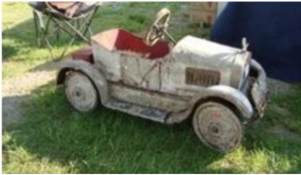
MY FIRST CAR