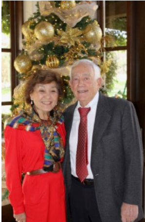
LYNN / LUTS