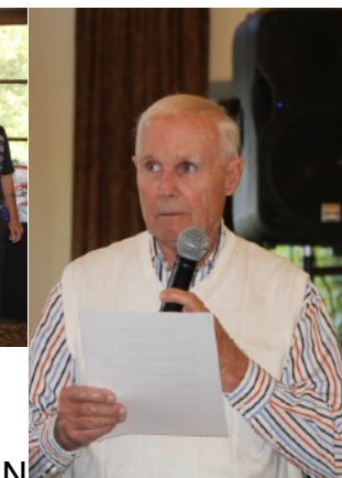
JAY, SWEARING AT EVERYONE!!