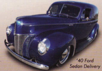
'40 Ford Sedan Delivery

760-740-2400 fax 760-740-8700 info@cgfordparts.com www.CGFordparts.com