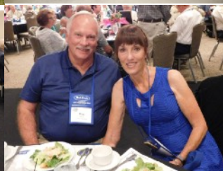
COUPLE VISITING FROM AUSTRALIA