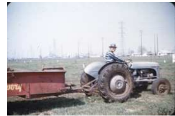
Grampa Westra spreading the Bull!!