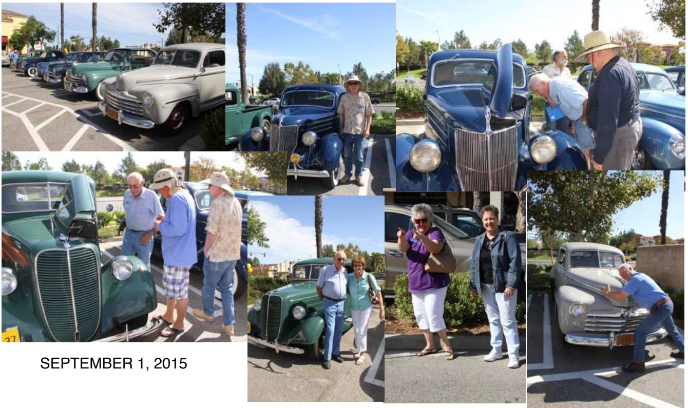
SEPTEMBER 1, 2015