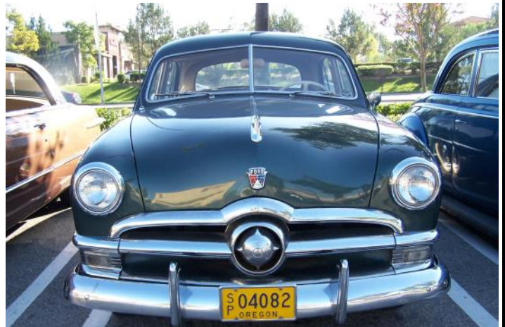
Cal & Cheryl's 1950 Ford