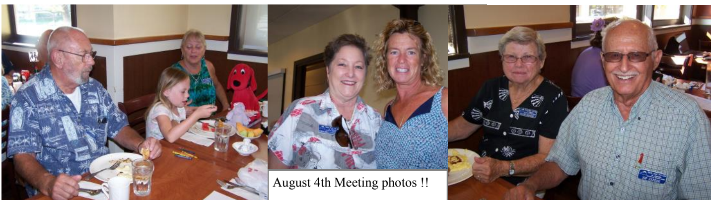
August 4th Meeting photos !!