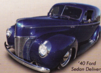
'40 Ford Sedan Delivery

760-740-2400 fax 760-740-8700 info@cgfordparts.com www.CGFordparts.com