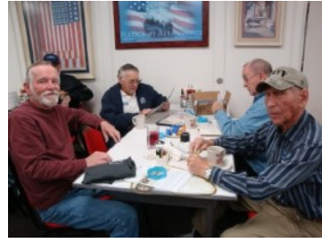
THE OTHER GROUP